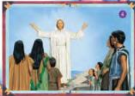
4 Jesus Christ appears to the people in America.