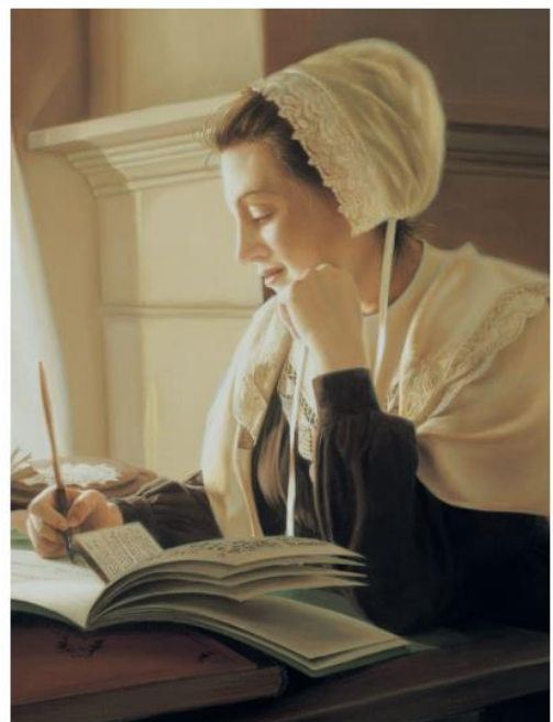
Emma's Hymns , by Liz Lemon Swindle