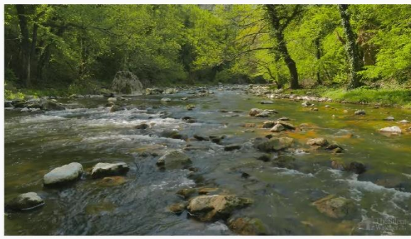
4K Relaxing River - Ultra HD Nature Video - Water Stream & Birdsong Sounds -